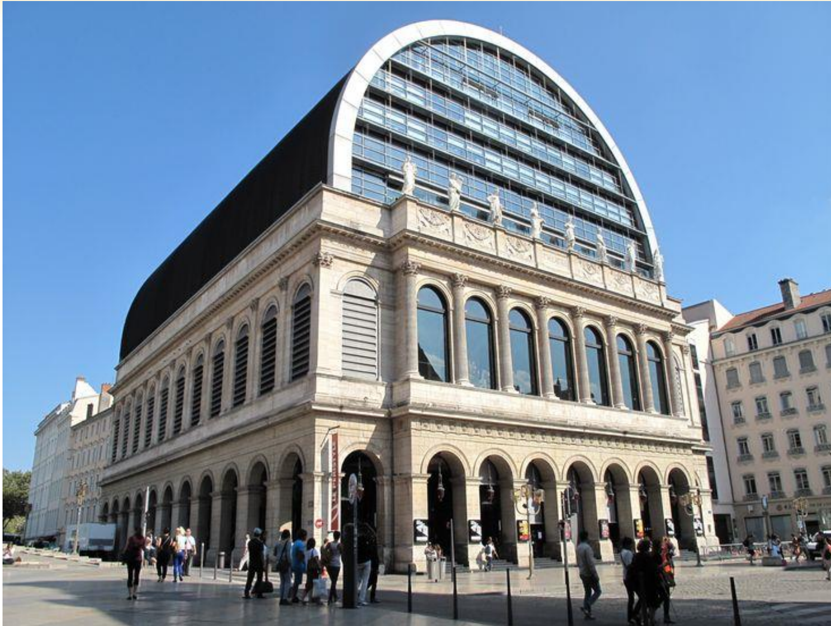
Opéra de Lyon, France